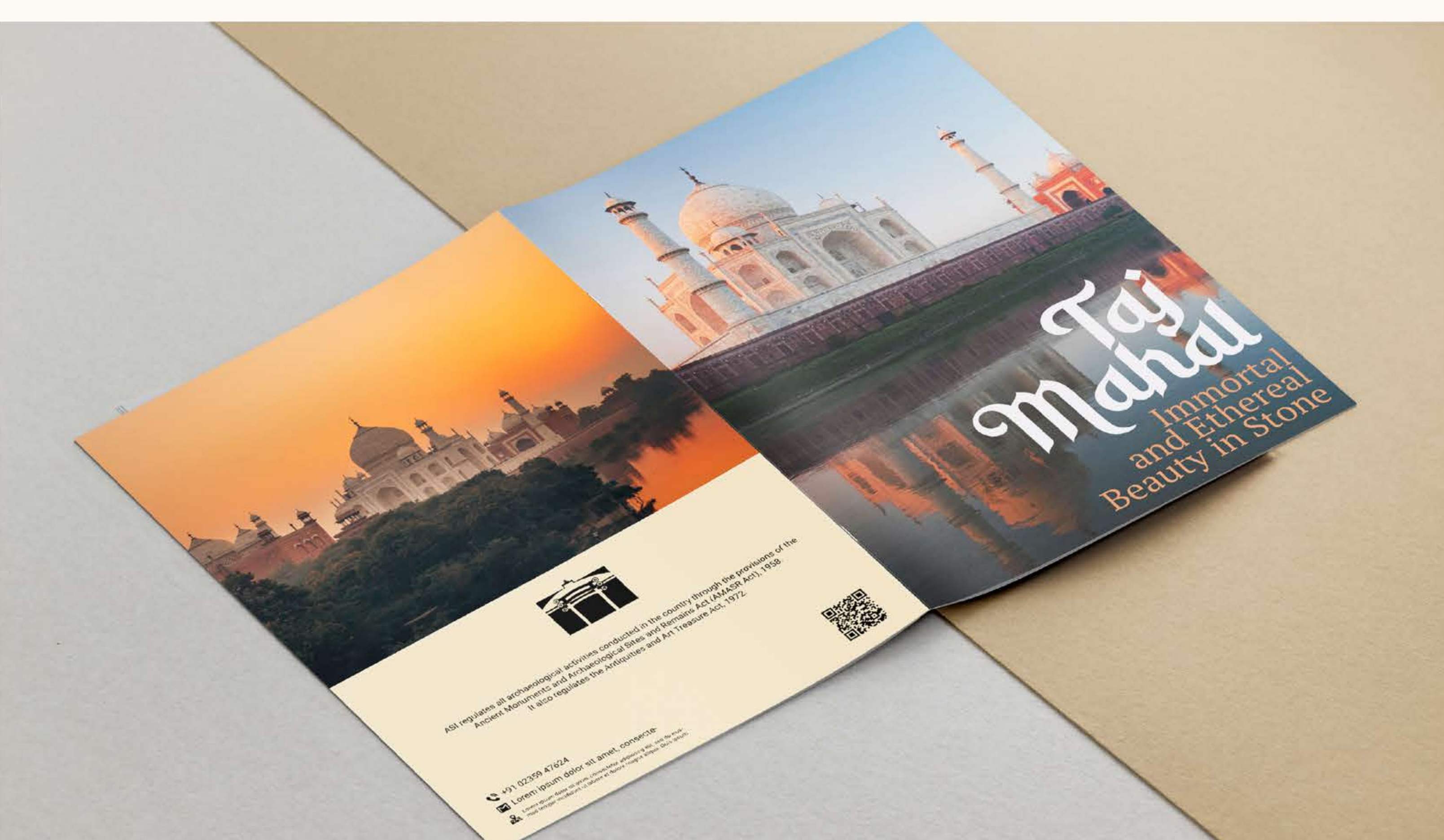
The ideas and inspiration were taken from the monument itself. The color scheme used is derived from the monument and represents different colors of Taj during the day. Cover spread exhibits Taj at sunrise, feature spread shows it during the day and back cover portray it at the time of sunset. The content specified talked majorly about the architecture of Taj. So keeping the same theme, I showed the Mughal-Islamic structure with its details in the photo spread, symmetry and arches in text spread.