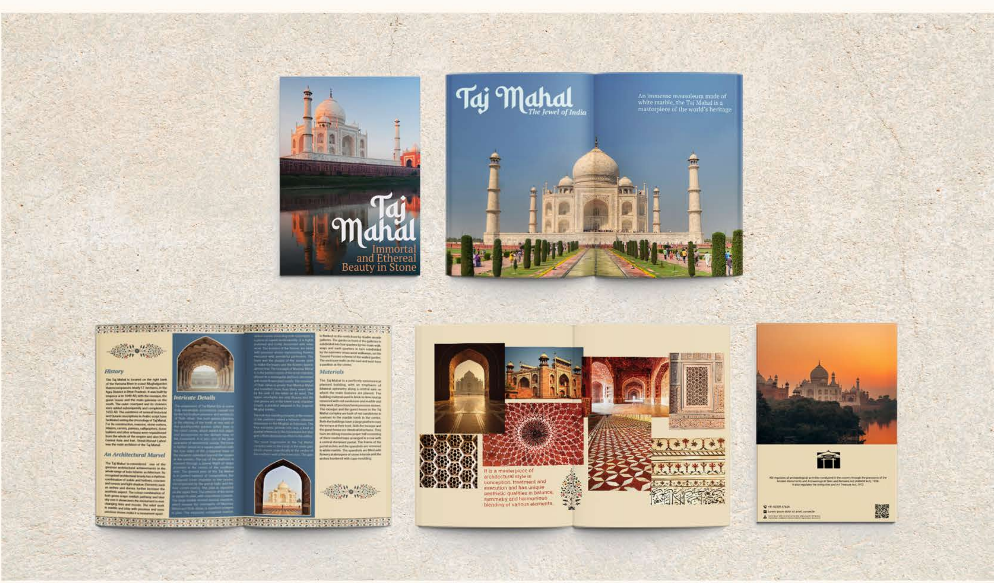
Design an 8-page printed brochure on the theme of Indian monuments. The Taj Mahal represents the finest architectural and artistic achievement through perfect harmony and excellent craftsmanship in a whole range of Indo-Islamic sepulchral architecture.